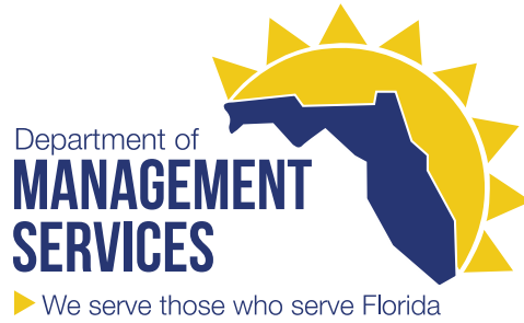
EXHIBIT A ADDITIONAL SPECIAL CONTRACT CONDITIONS

The Contractor and agencies, as defined in section 287.012, Florida Statutes acknowledge and agree to be bound by the terms and conditions of the Master Contract except as otherwise specified in the Contract, which includes the Special Contract Conditions and these Additional Special Contract Conditions.